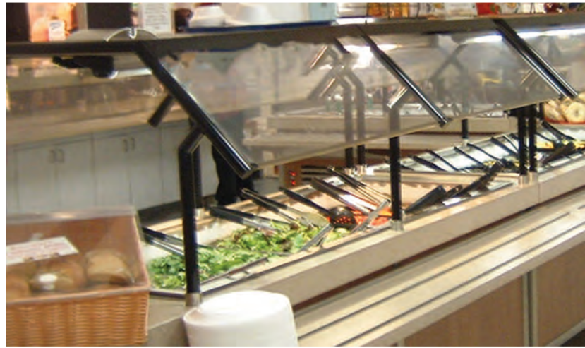
Director's Choice® Modular Cafeteria Line

Third – prompt, efficient delivery. We do our best to ship your counters and bars fully assembled and crated. We work with manufacturing schedules to meet stringent deadlines and offer on-site installation services.