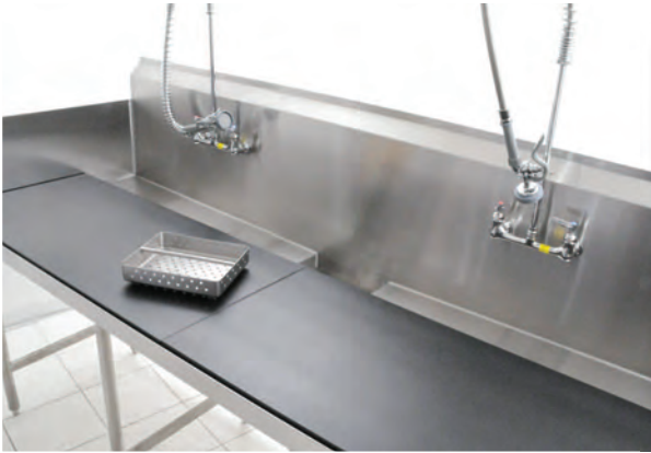
fish cleaning table/sink