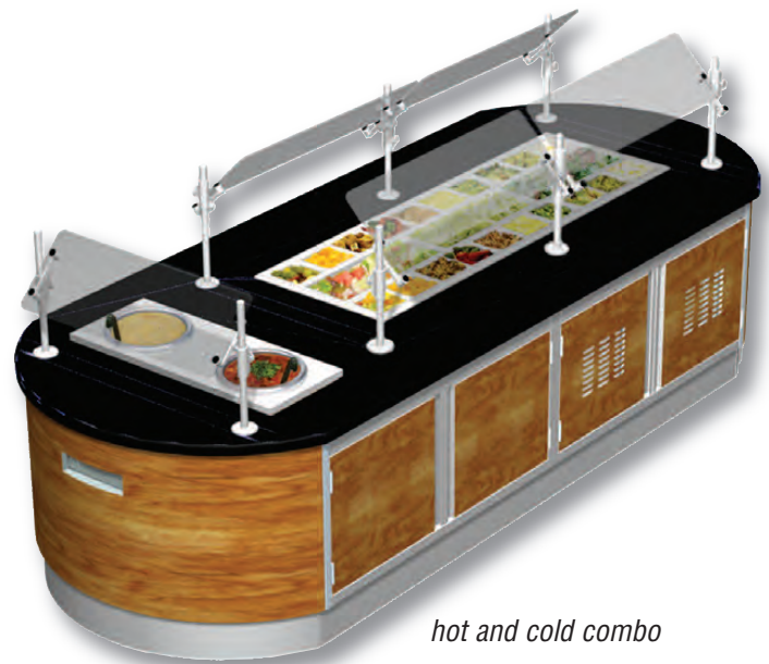
hot and cold combo

Eagle offers personalized branding through graphic designs as an option. Select from stainless steel, various plastics, laminates, solid surface man-made and naturally occurring materials, woods, magnetic sheets and designer aluminum. We provide a 3D rendering of your logo or design prior to production.