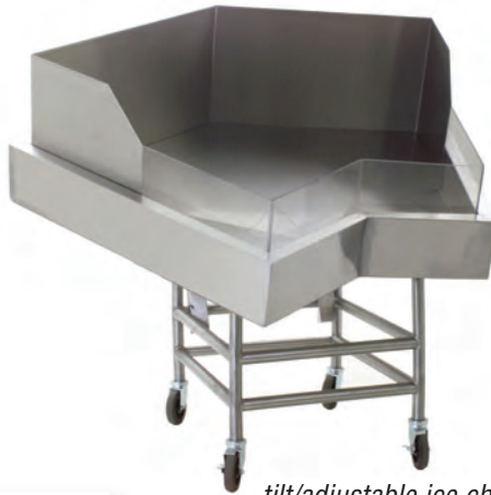
tilt/adjustable ice chest